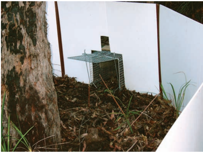
Figure 2. The cage trap is inserted through the opening in the trap wall, being careful to ensure that gate closure will not be obstructed.