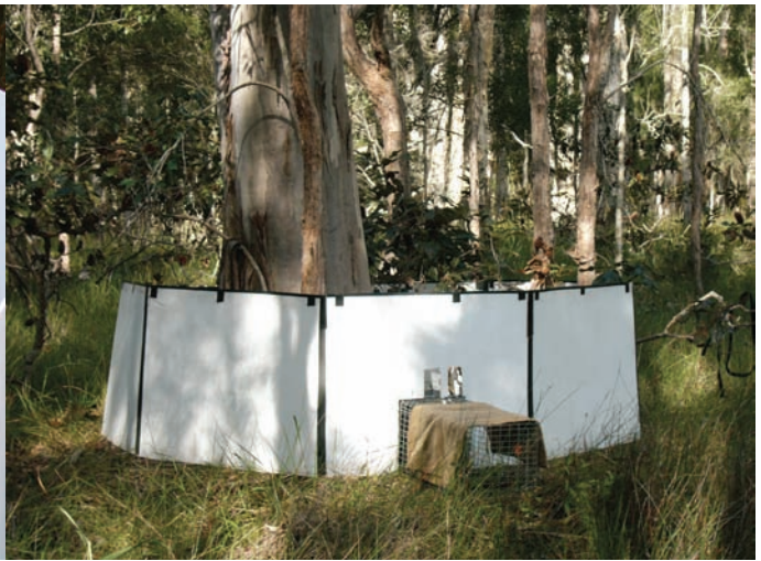
Figure 3. The same trap in Fig.1 erected around a large Forest Red Gum E. tereticornis . Note placement of the hessian bag such that the distal end of the cage trap is left uncovered.